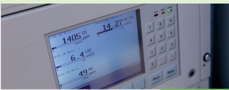
Measured value display exhaust gas analyser